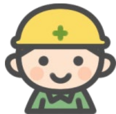
AtoN Administration Entity

JCG may temporarily display virtual AtoNs on behalf of the private entities without AIS transmitting capability upon request, with necessary fees.