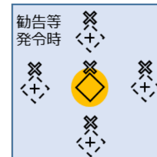
Under the presence of advisory, etc.