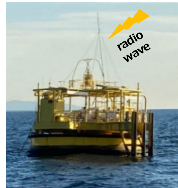
An Example of AtoN to transmit virtual AtoN signals