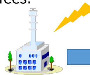
JCG AIS station